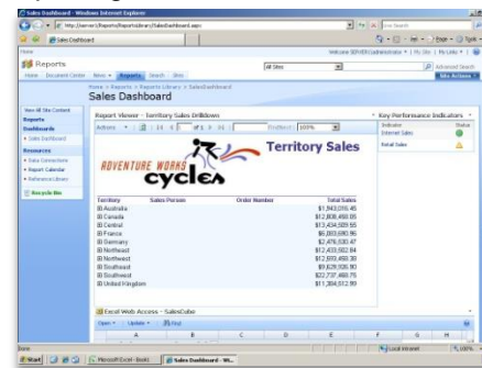
Embedded reporting in Microsoft Office SharePoint Services

Use the Visual Studio reporting controls to provide embedded reporting in business applications. Publish reports in Microsoft Office SharePoint sites to create a reporting dashboard.