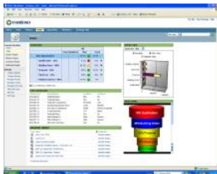
Fig. 1 - Easily customize the view by function or role.

A Microsoft Office product, Business Scorecard Manager empowers employees to build, manage, and use their own scorecards, reports, and visual resources using familiar tools. With these tools, employees can analyze relationships between key performance indicators (KPIs) and tangible business objectives.