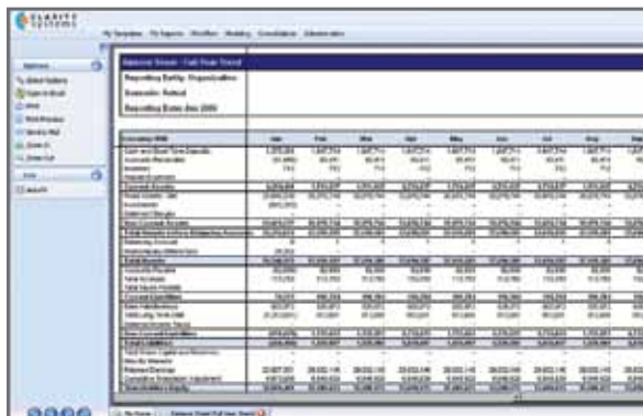
Create highly formatted boardroom quality reports.

Clarity Reporting's publish-ready report books and e-mail distribution allows organizations to quickly get information to any employee.