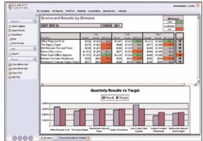
Use scorecards to measure and monitor organizational performance.

Clarity Reporting eliminates the need for multiple reporting applications and the costs resulting from duplicating training, maintenance, and administration.