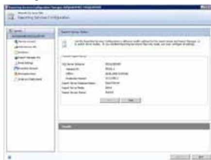
Reporting Services Configuration Manager

Schedule report execution, manage report subscriptions, and control access to reports through the Web-based Report Manager or integrate Reporting Services with Microsoft SharePoint technologies for central manageability of reports. Deploy and manage all of your Reporting Services configuration options with Reporting Services Configuration Manager.