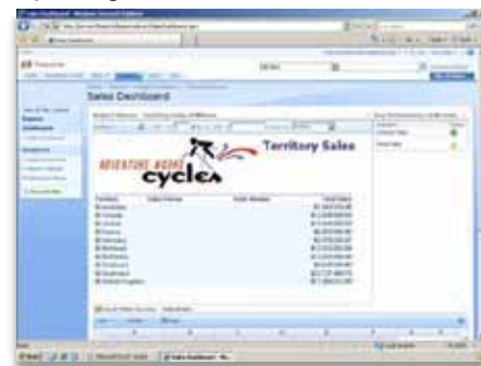
Embedded reporting in Microsoft Office SharePoint Services

Use the Visual Studio reporting controls to provide embedded reporting in business applications. Publish reports in Microsoft Office SharePoint sites to create a reporting dashboard.