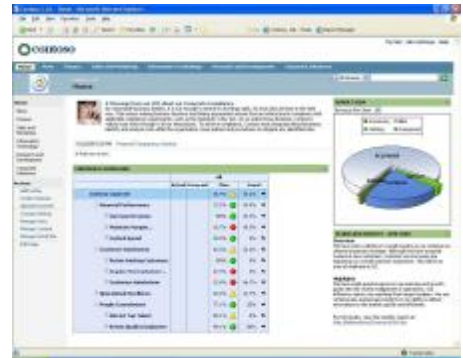
Fig. 2 - Easily define and articulate your business strategy.