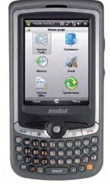
Answer customer queries on the spot