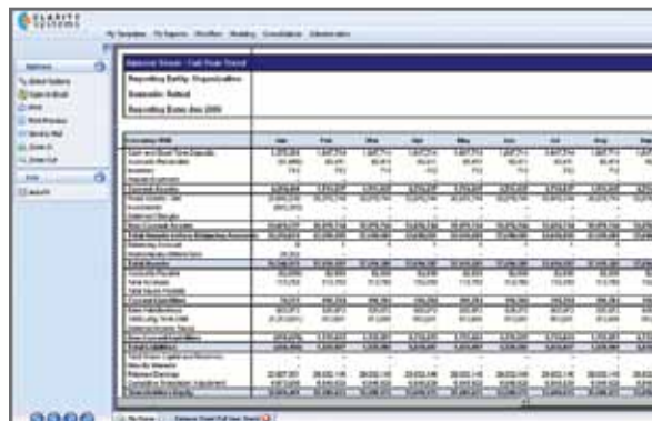
Create highly formatted boardroom quality reports.

Clarity Reporting's publish-ready report books and e-mail distribution allows organizations to quickly get information to any employee.