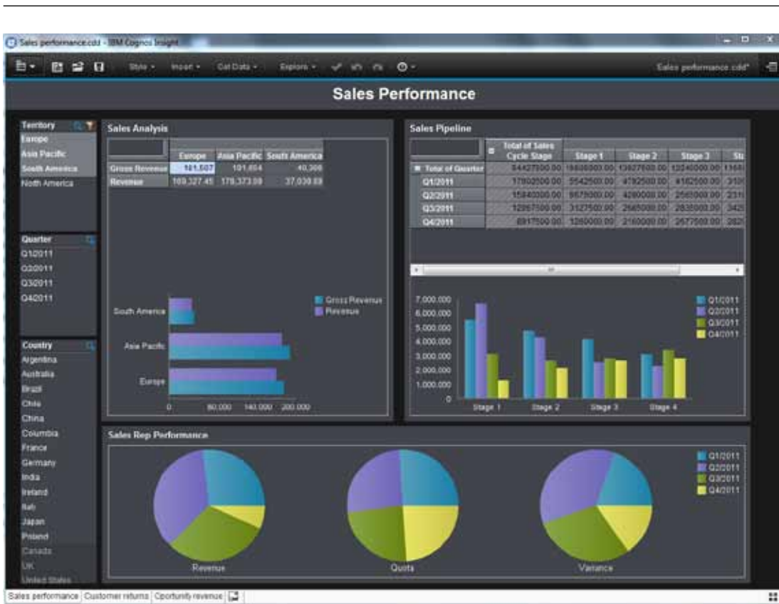
Figure 3: “What-if” scenario modeling lets you analyze and optimize your plans based on different assumptions that take into account ever-changing market conditions.

To easily navigate through large data sets with multiple dimensions, you can filter results based on the association between related groups of information. You can even apply a simple search to these explore points to further drill down to a particular member in a set and other information related to that member. When combined with visualizations, this powerful point-and-click approach allows you to quickly spot trends and identify outliers.