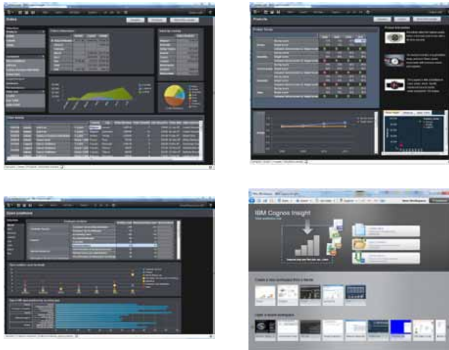
Figure 1: An intuitive, easy-to-use interface provides complete user flexibility to independently create compelling dashboards and analytic applications.