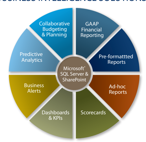
Microsoft<sup>®</sup> Windows Server